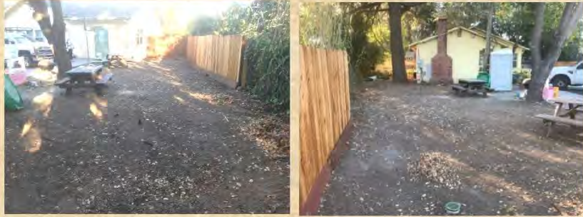
Before pictures of the Women's Recovery Center

Pavers Fence Planters Irrigation Lighting Mulch Area @ Planter Boxes