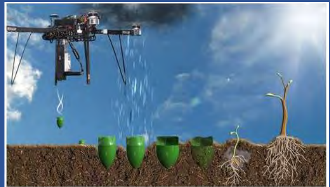
The drones will fire pods containing pre-germinated seeds at the ground

My grandmother lived to be almost 100 years old and in the span of her lifetime from 1899 to 1994 she saw science and technology go from horse and buggies to landing a man on the moon. And since then, scientific evolution has been on an even more accelerated path! Growing exponentially every year!